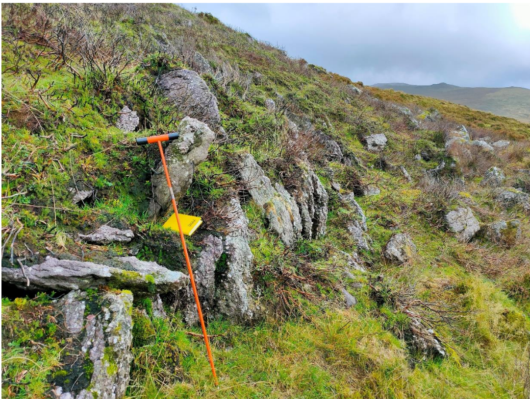
Point of interest location Ph018 (view south-southeast) – large conglomerate boulders on slope