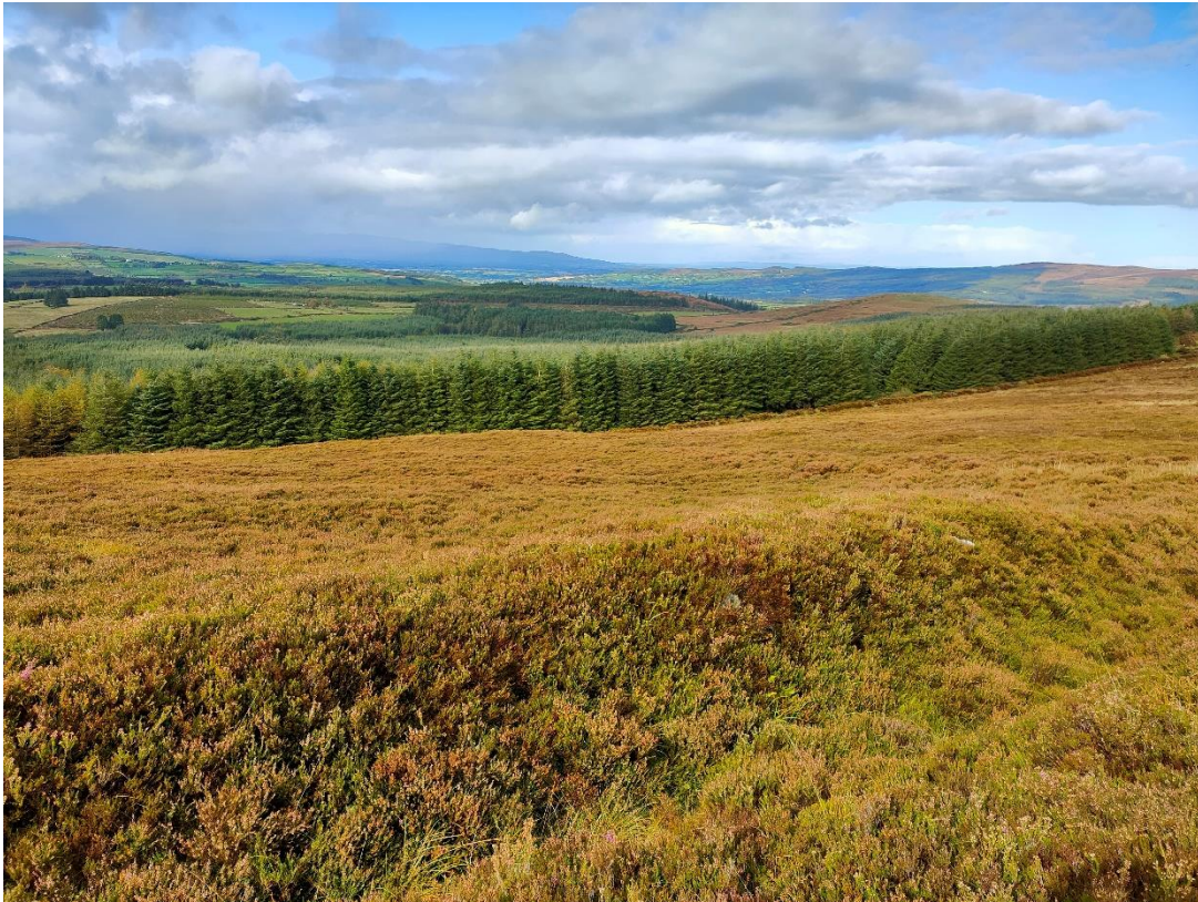
Point of interest location Ph007 (view northwest) – ephemeral valley feature