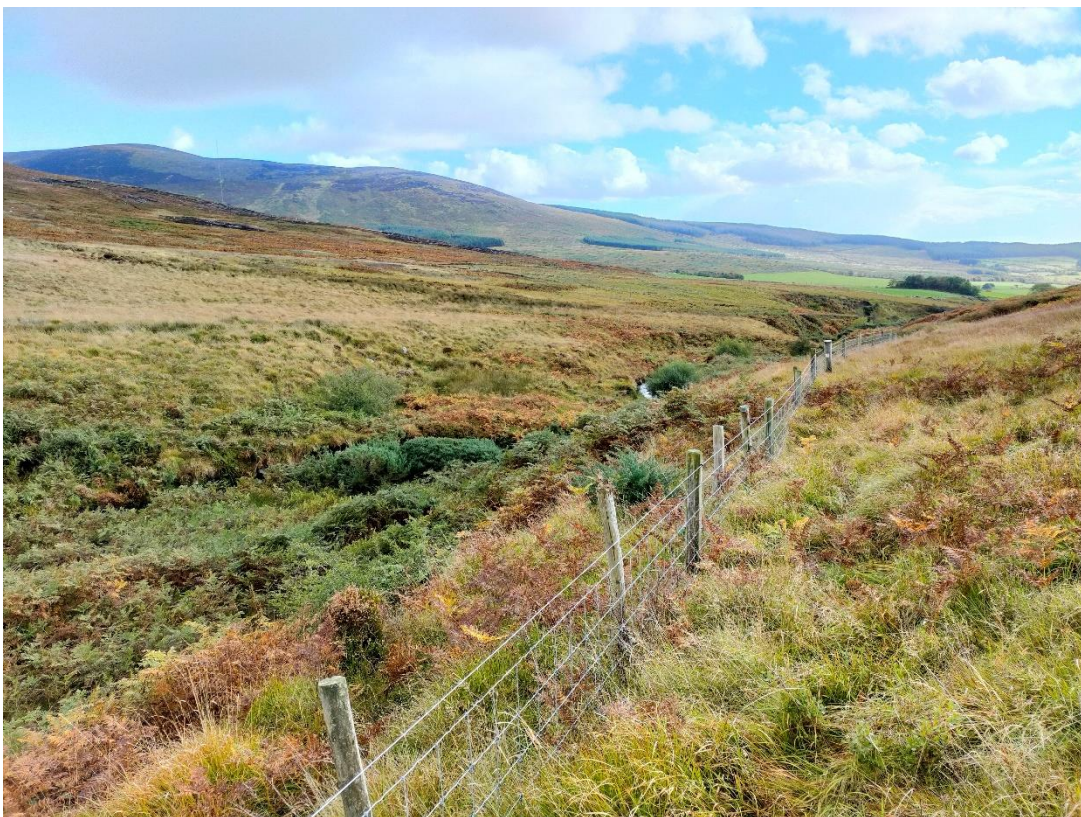
Probe location 010 (view south) – proposed Colligan River crossing (west side)