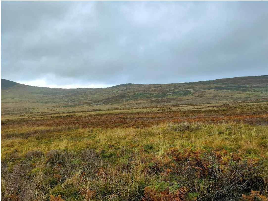
Probe location 019 (view north) – at Turbine T07