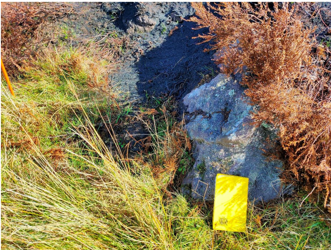
Point of interest location Ph008 (view east) - conglomerate boulder