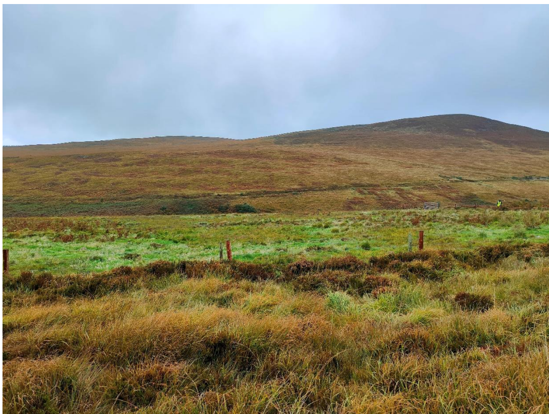
Probe location 007 (view west) – at Turbine T08