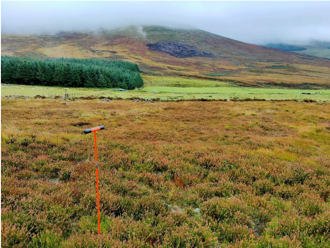
Probe location 056 (view east) – at substation