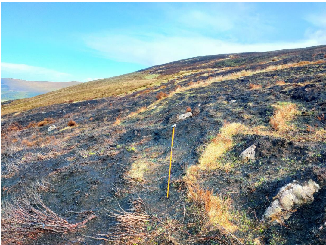
Probe location 038 (view north) – recently burnt vegetation exposing boulders