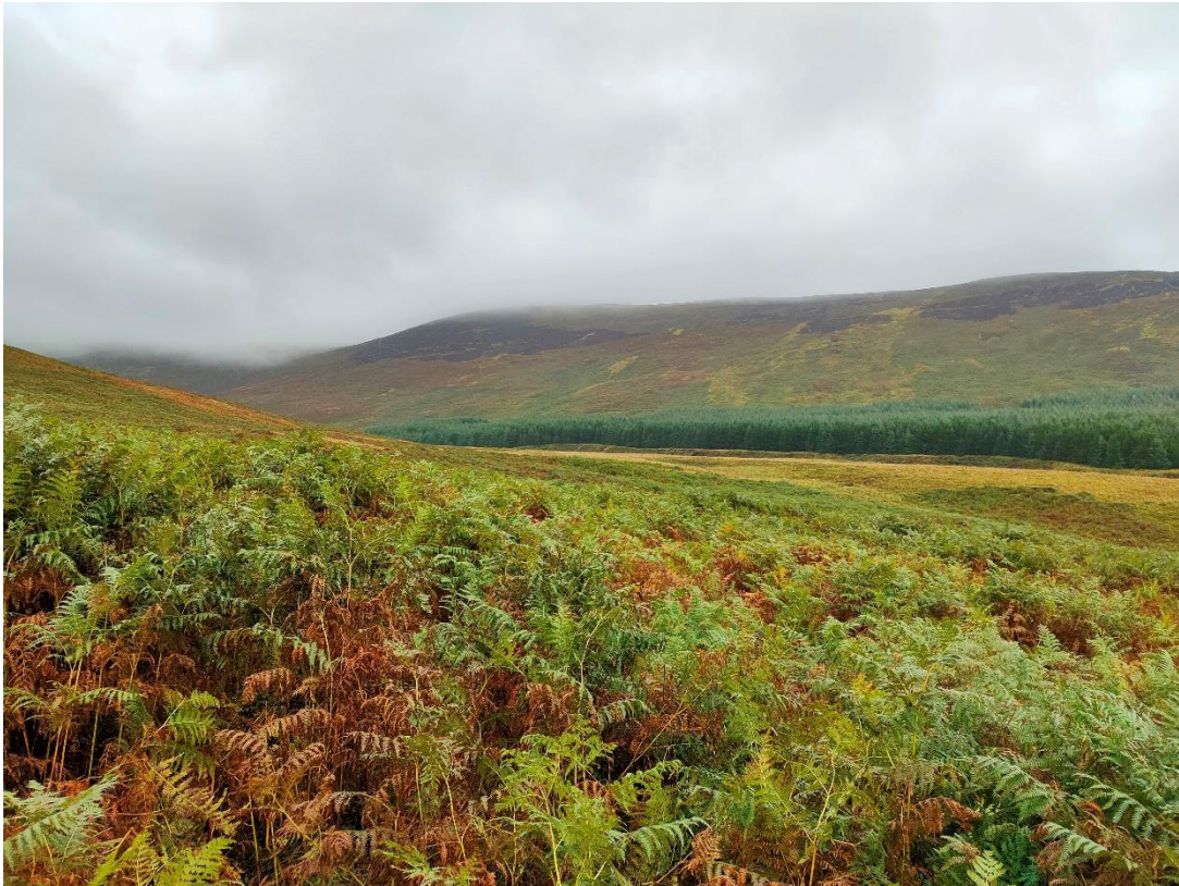
Probe location 001 (view east) – at Turbine T11