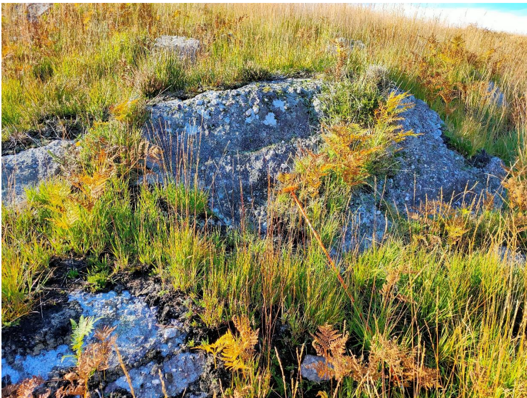
Point of interest location Ph010 (view northwest) – massive to thickly bedded conglomerate outcrop