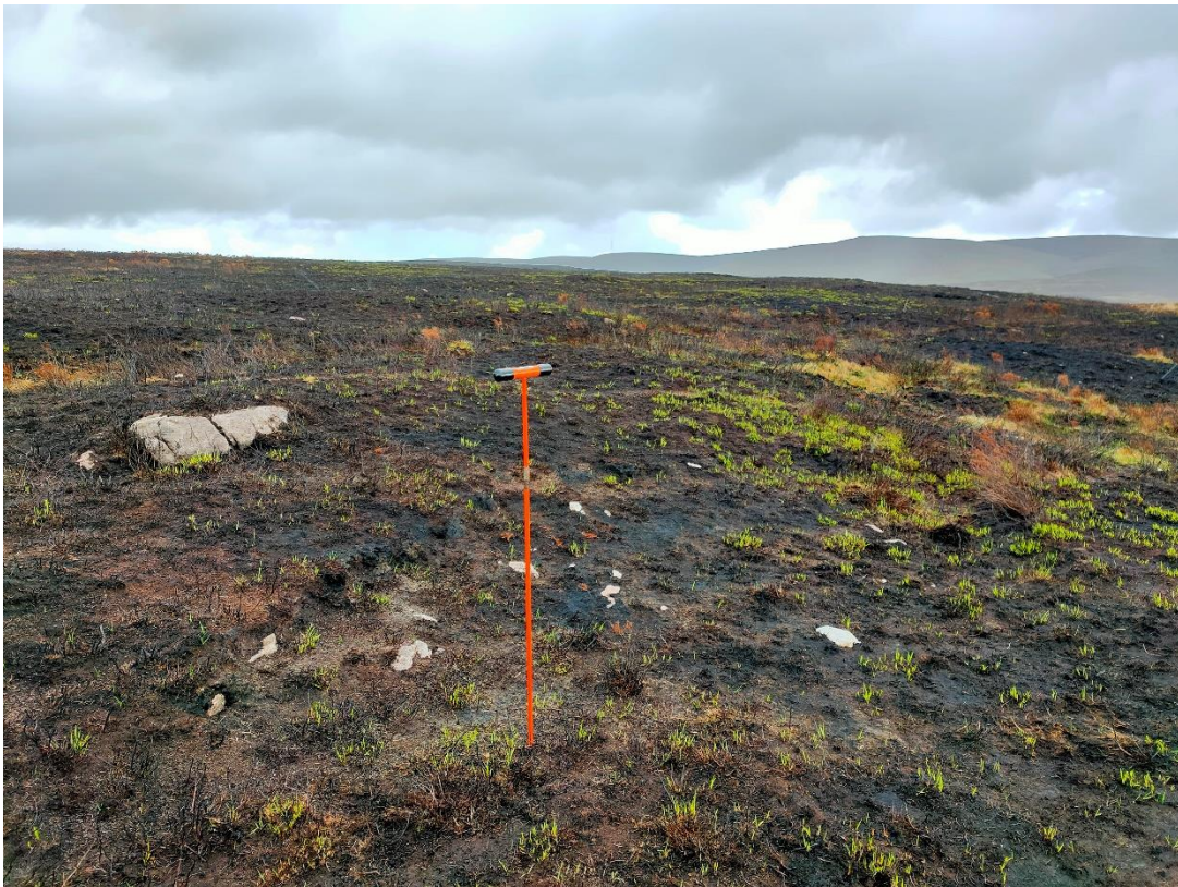
Probe location 045 (view east) – at Turbine T01 (recently burnt vegetation)