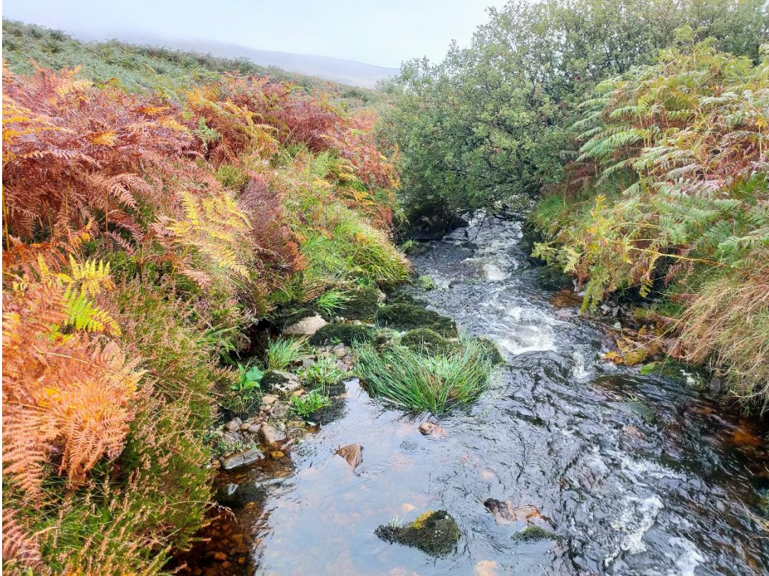
Point of interest location Ph015 (view south) – Colligan River Crossing. Till exposed in river bed