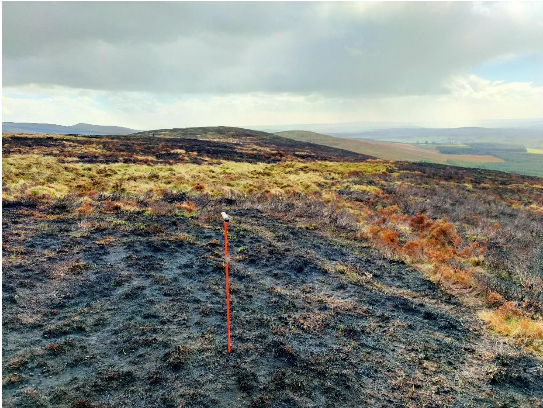
Probe location 044 (view south) – recently burnt vegetation