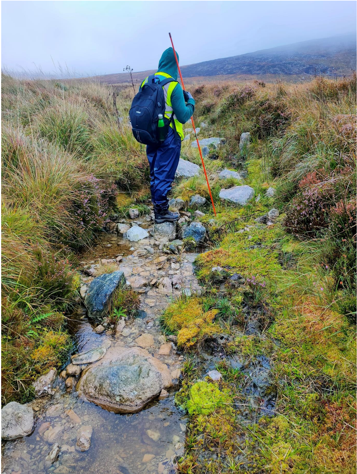
Point of interest location Ph014 (view east) - shallow till under organic topsoil.