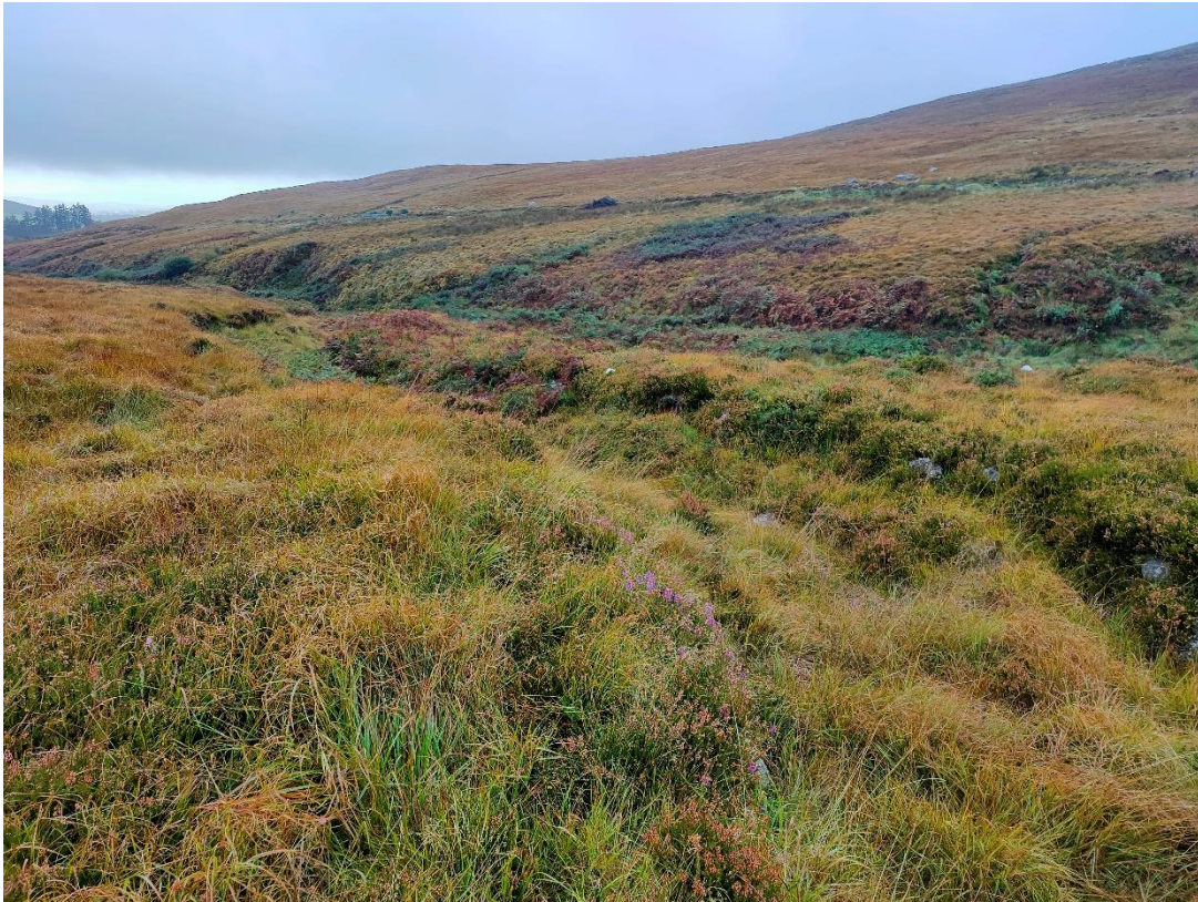
Point of interest location Ph013 (view south-southwest) – likely ephemeral valley feature