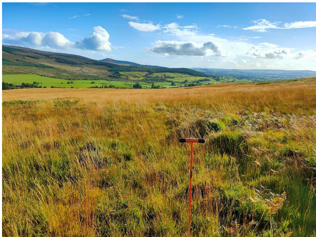
Probe location 014 (view south) – at Turbine T12