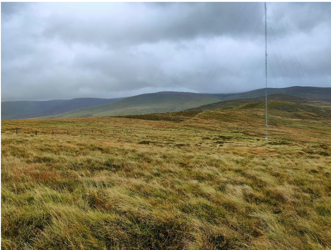
Probe location 029 (view east) – at Turbine T02 and view of existing met mast