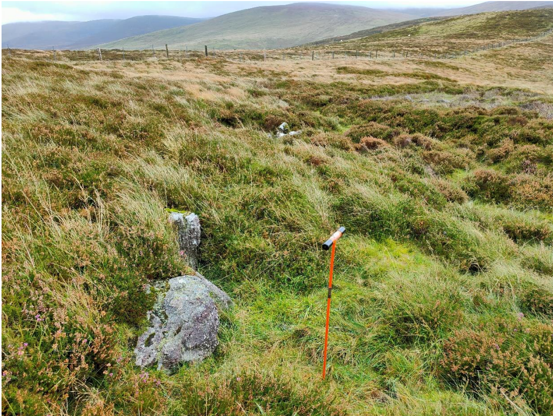
Probe location 027 (view east) – conglomerate outcrops