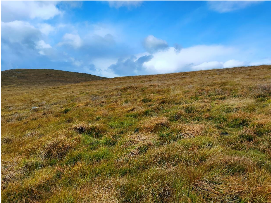
Probe location 053 (view west)