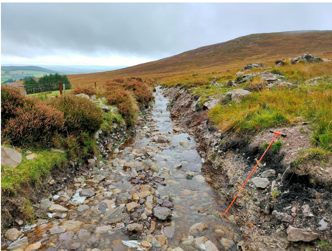
Point of interest location Ph001 (view south-southeast) – 100mm blanket peat over till