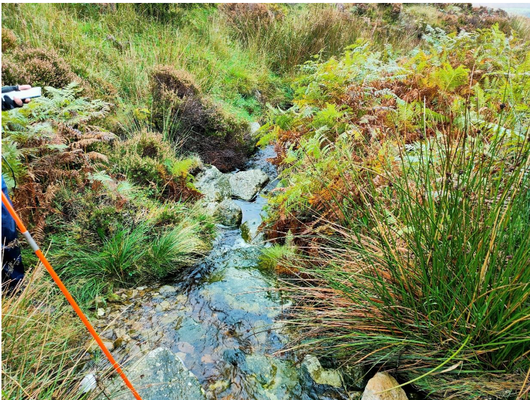
Point of interest location Ph016 (view west) – shallow Till exposed in stream bed