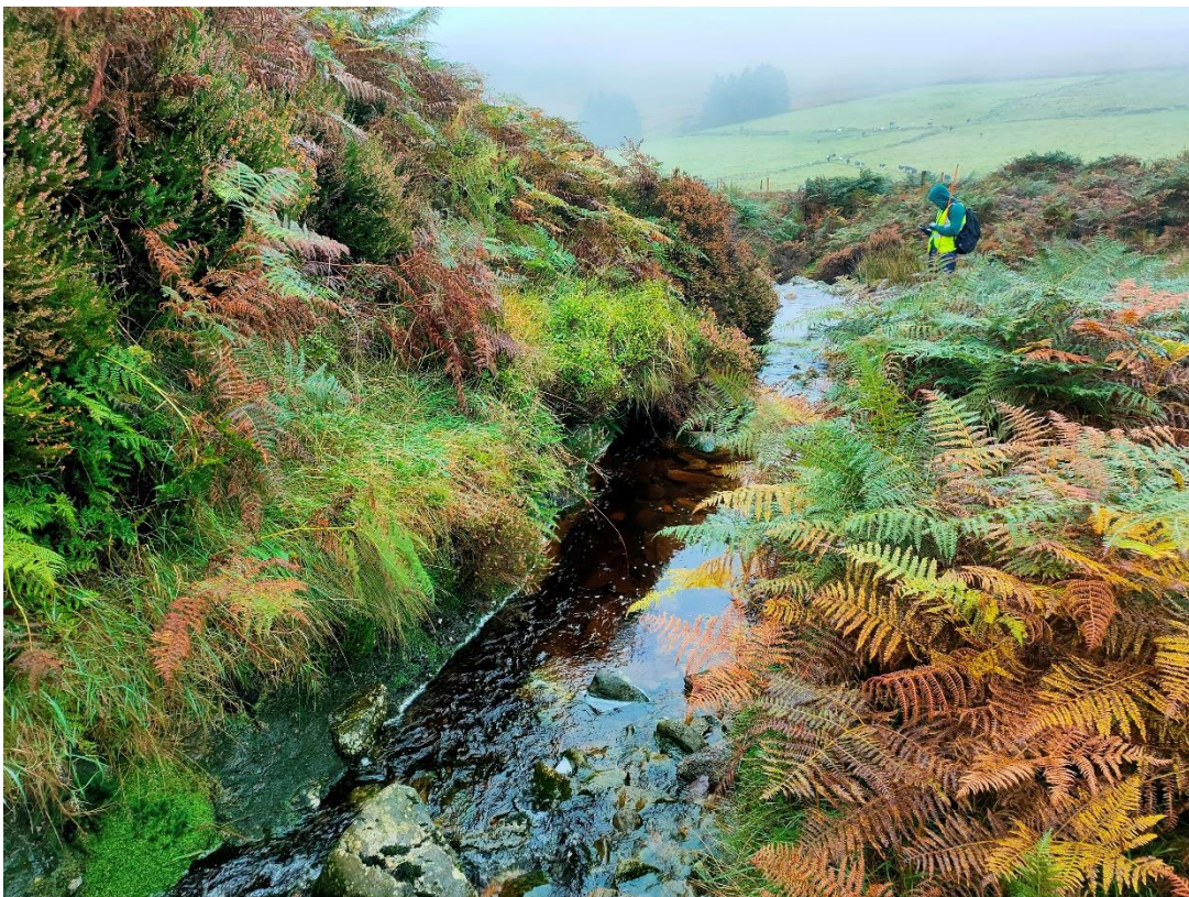
Point of interest location Ph012 (view west) – stream exposing Till with no indication of Alluvium