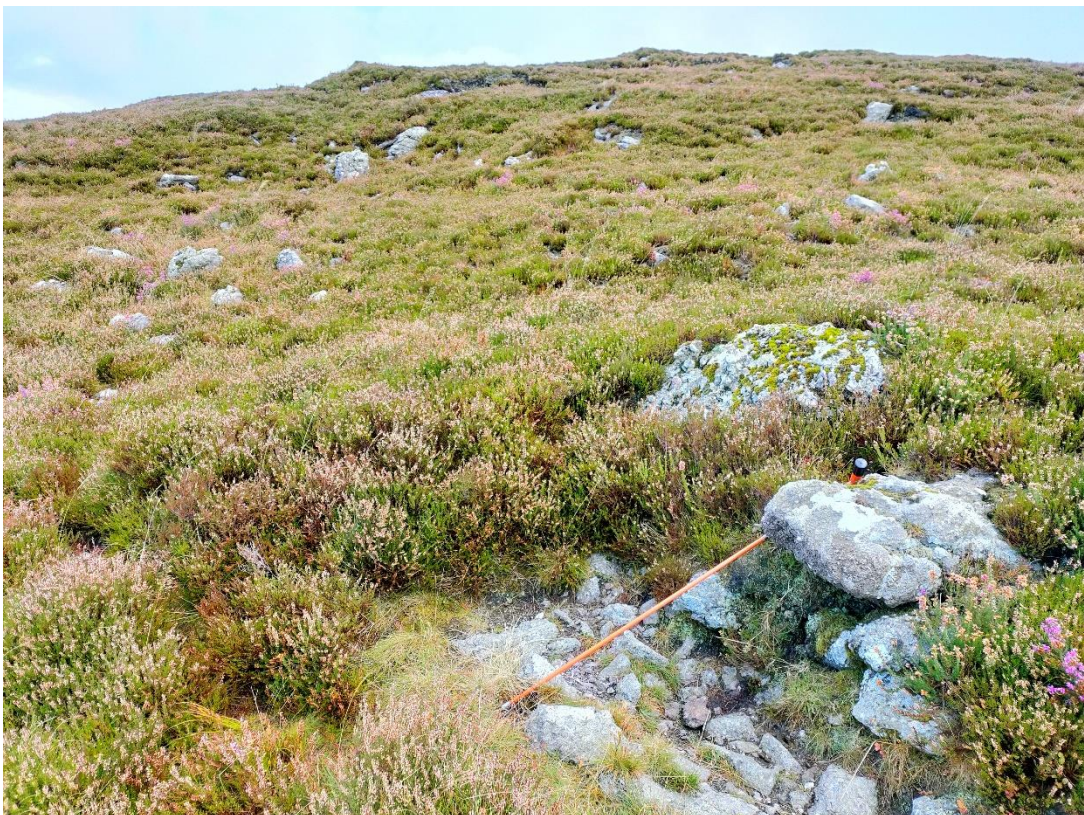
Point of interest location Ph006 (view east) – thickly bedded conglomerate outcrop