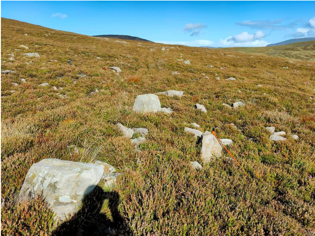
Point of interest location Ph009 (view east-northeast) – sandstone boulder field