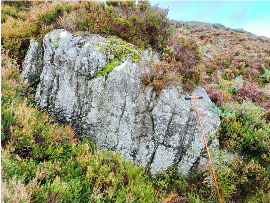
Point of interest location Ph005 (view south) – massive to thickly bedded conglomerate outcrop