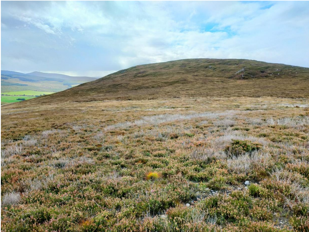
Probe location 051 (view south)