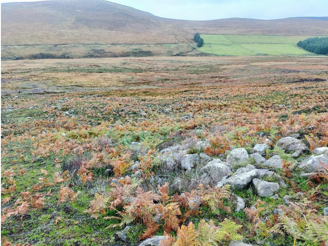
Probe location 017 (view east) – boulders exposed. Possible shallow bedrock.