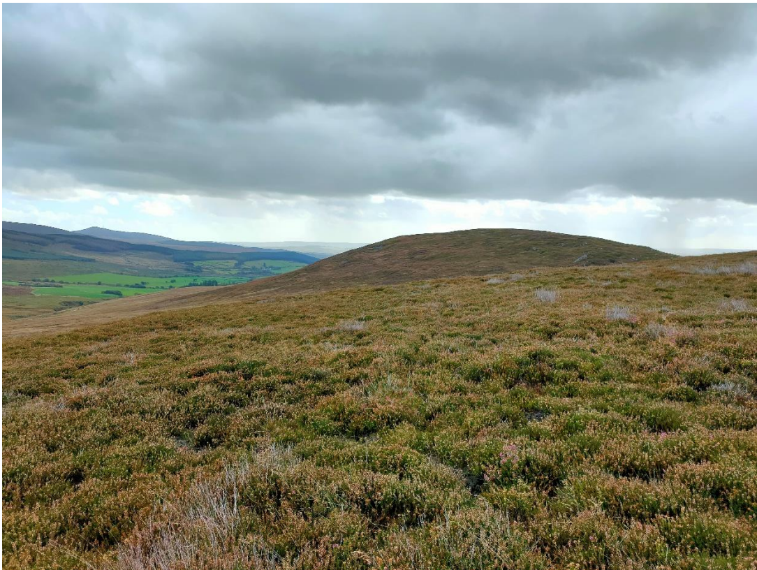
Probe location 050 (view south) – at Turbine T04