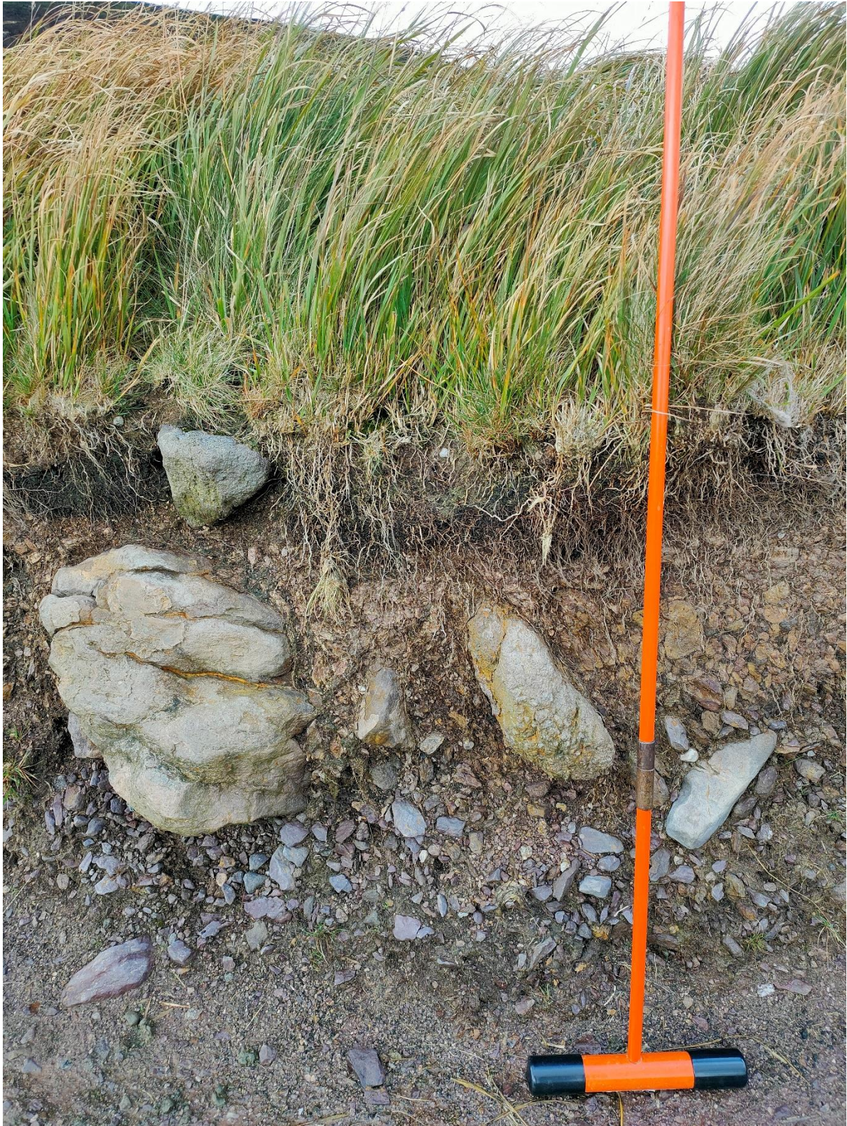
Representative section through peaty topsoil (100mm) and coarse-grained till