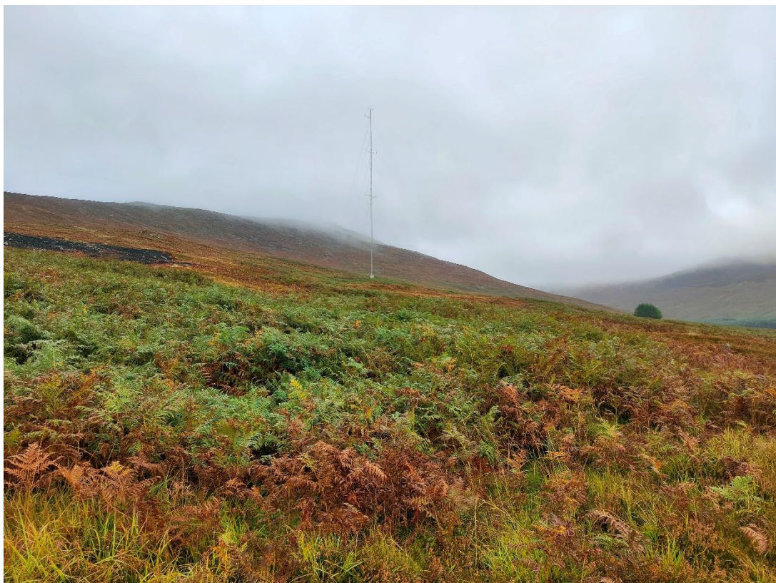
Probe location 004 (view east) – at Turbine T10