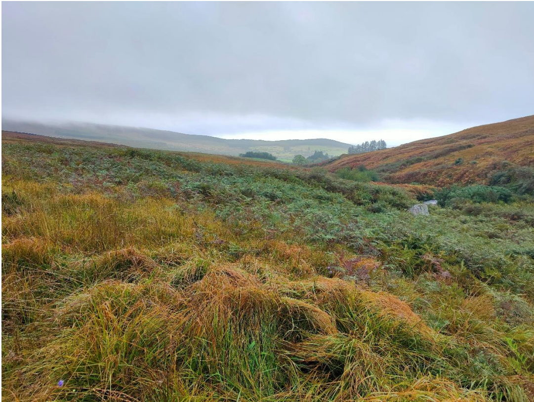
Probe location 009 (view north) – proposed Colligan River crossing (east side)