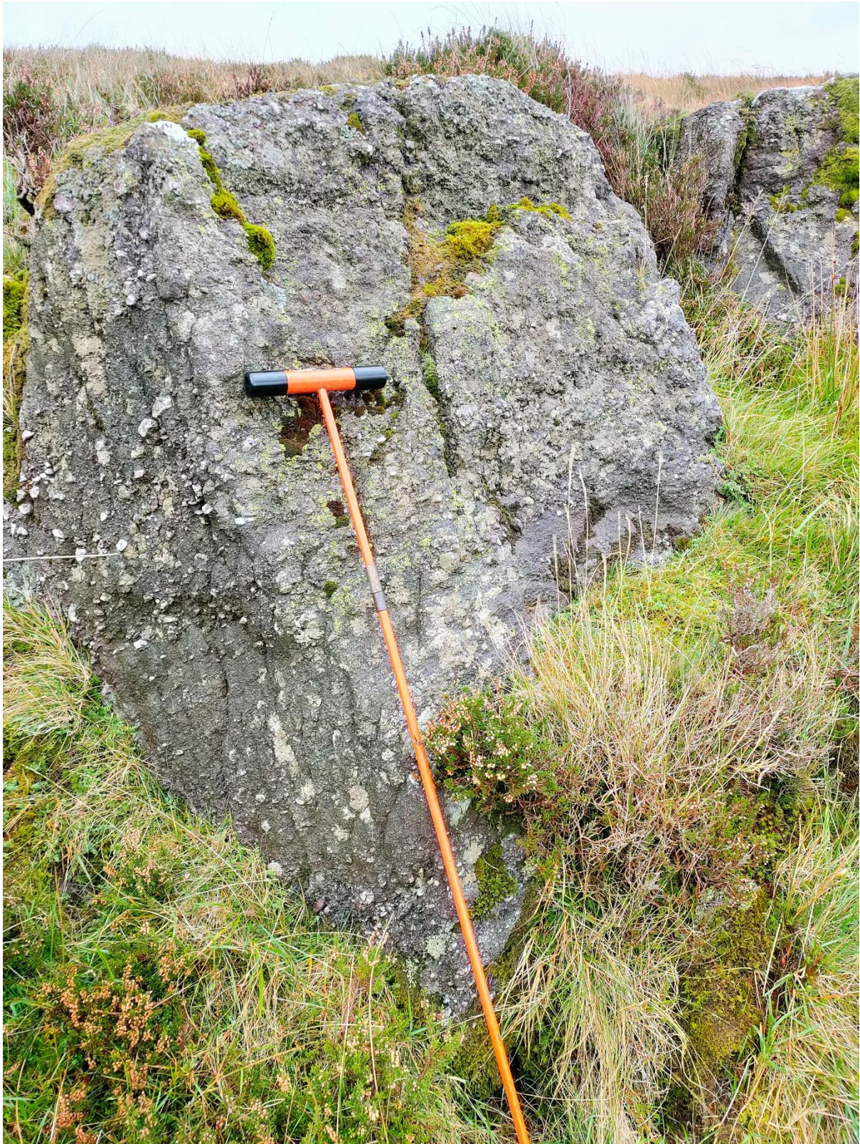
Point of interest location Ph019 (view northeast) – outcrop of thick to massively bedded purple conglomerate