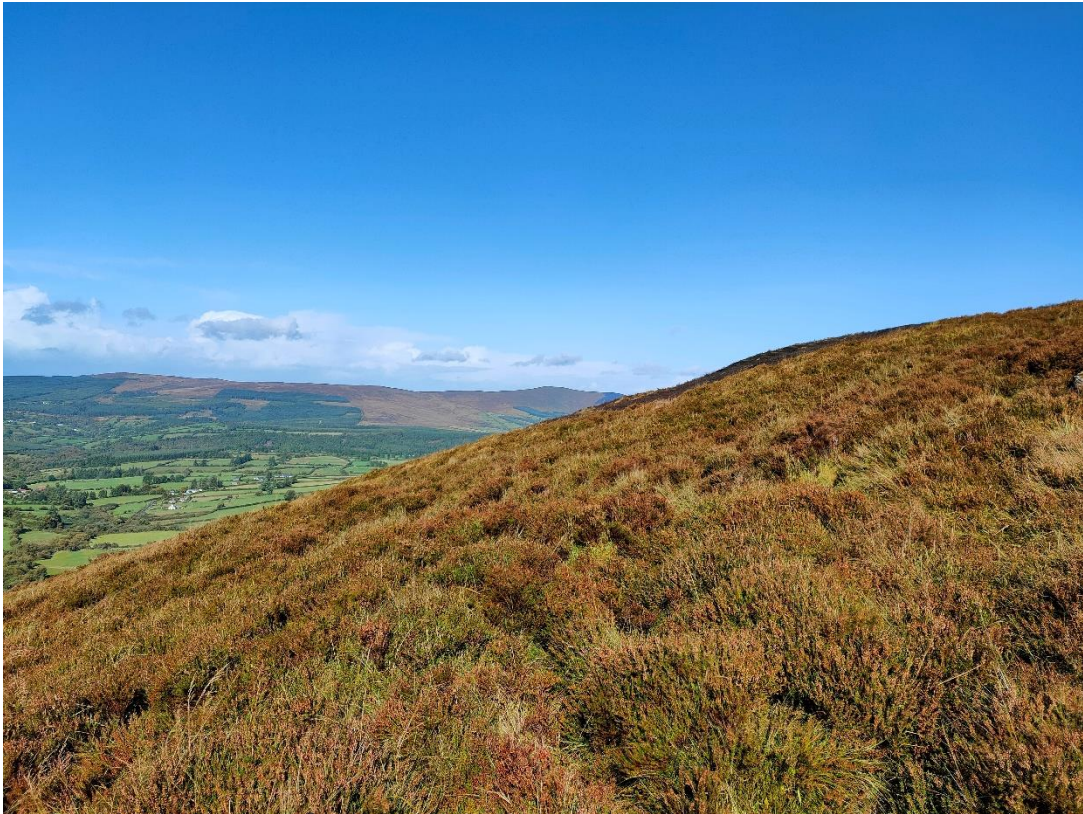
Probe location 036 (view north)