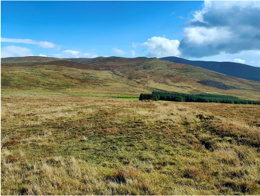
Probe location 049 (view east)