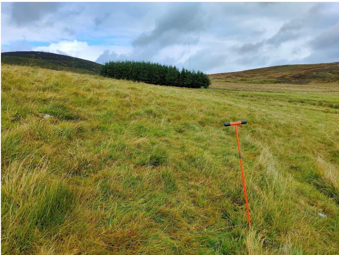
Probe location 054 (view north) – at Turbine T05