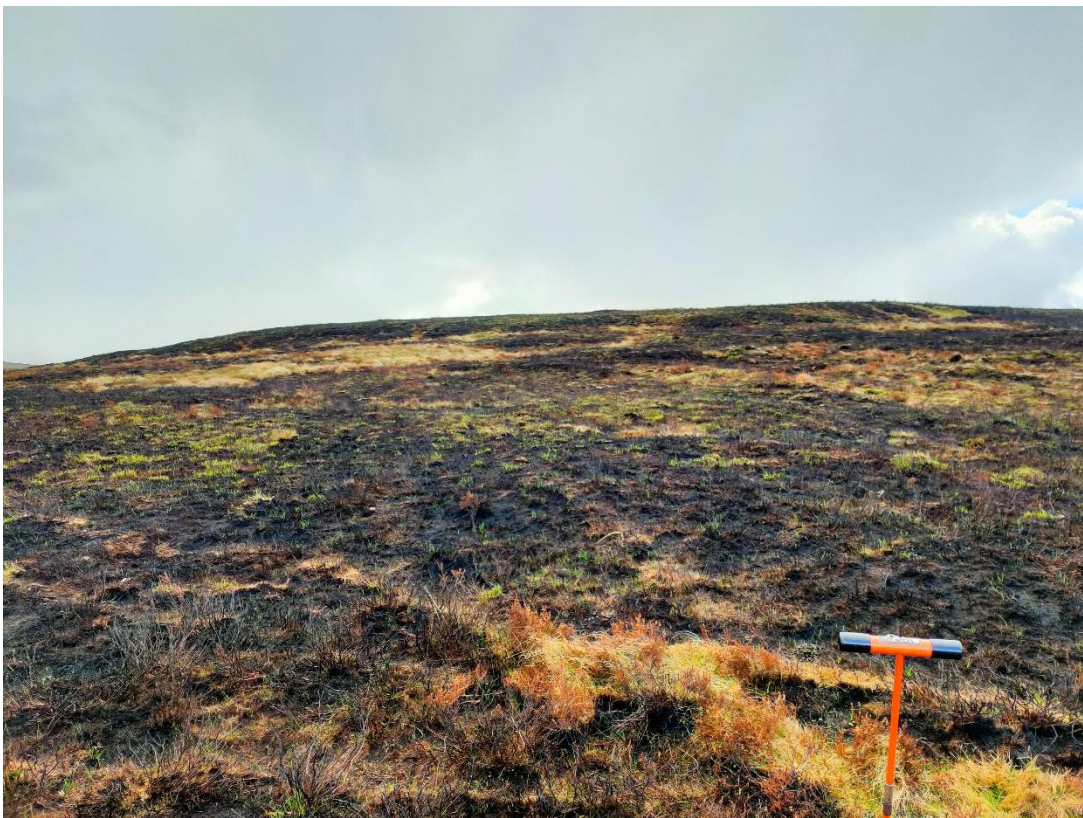
Probe location 042 (view south) – recently burnt vegetation