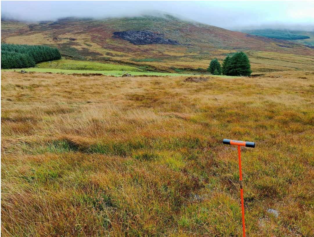
Probe location 058 (view east) – at substation