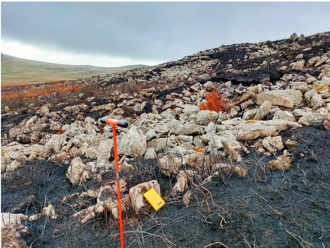
Probe location 018 (view north) – boulders exposed. Possible shallow bedrock.