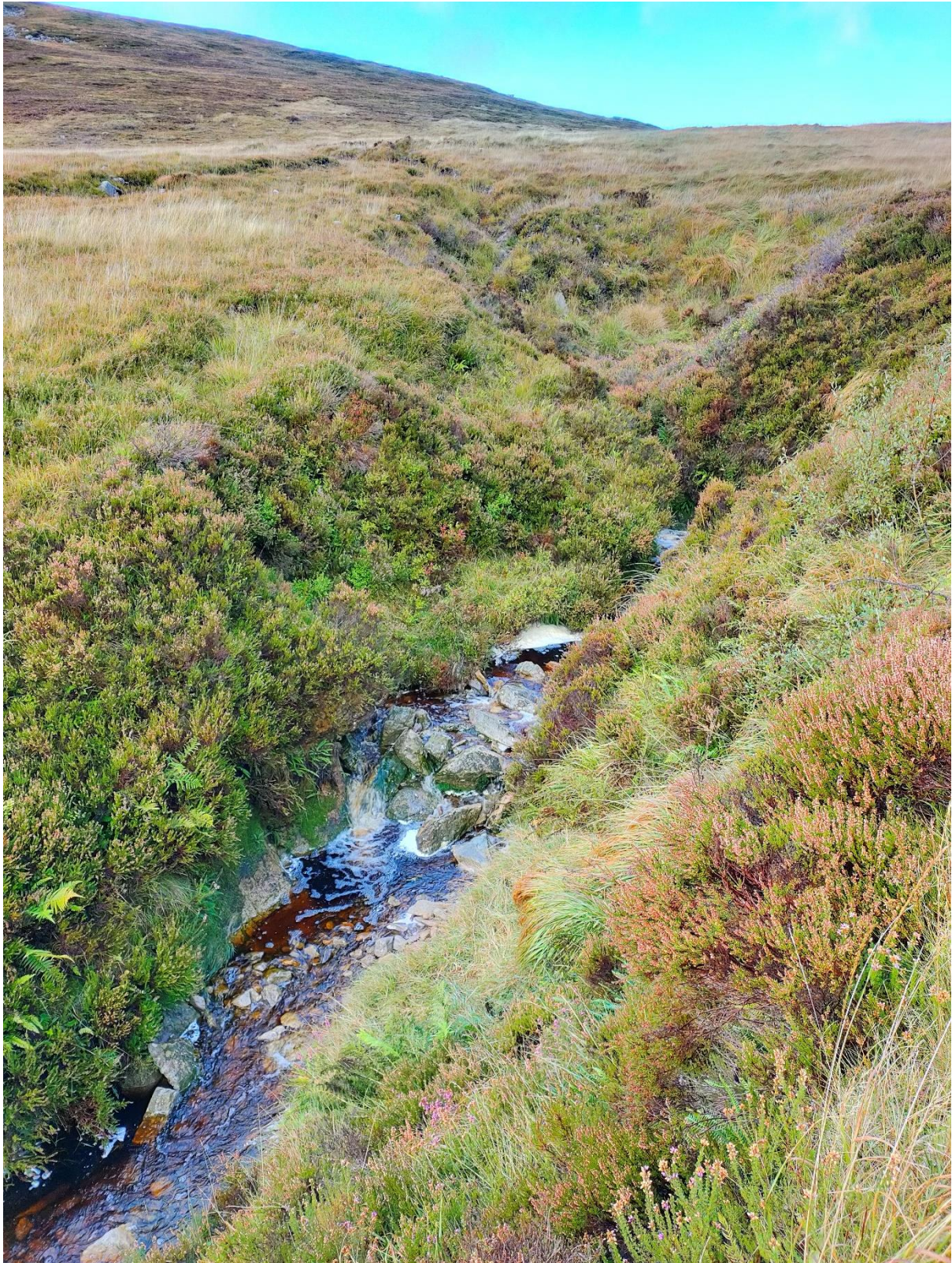
Point of interest location Ph002 (view east) – bedrock exposed in stream bed