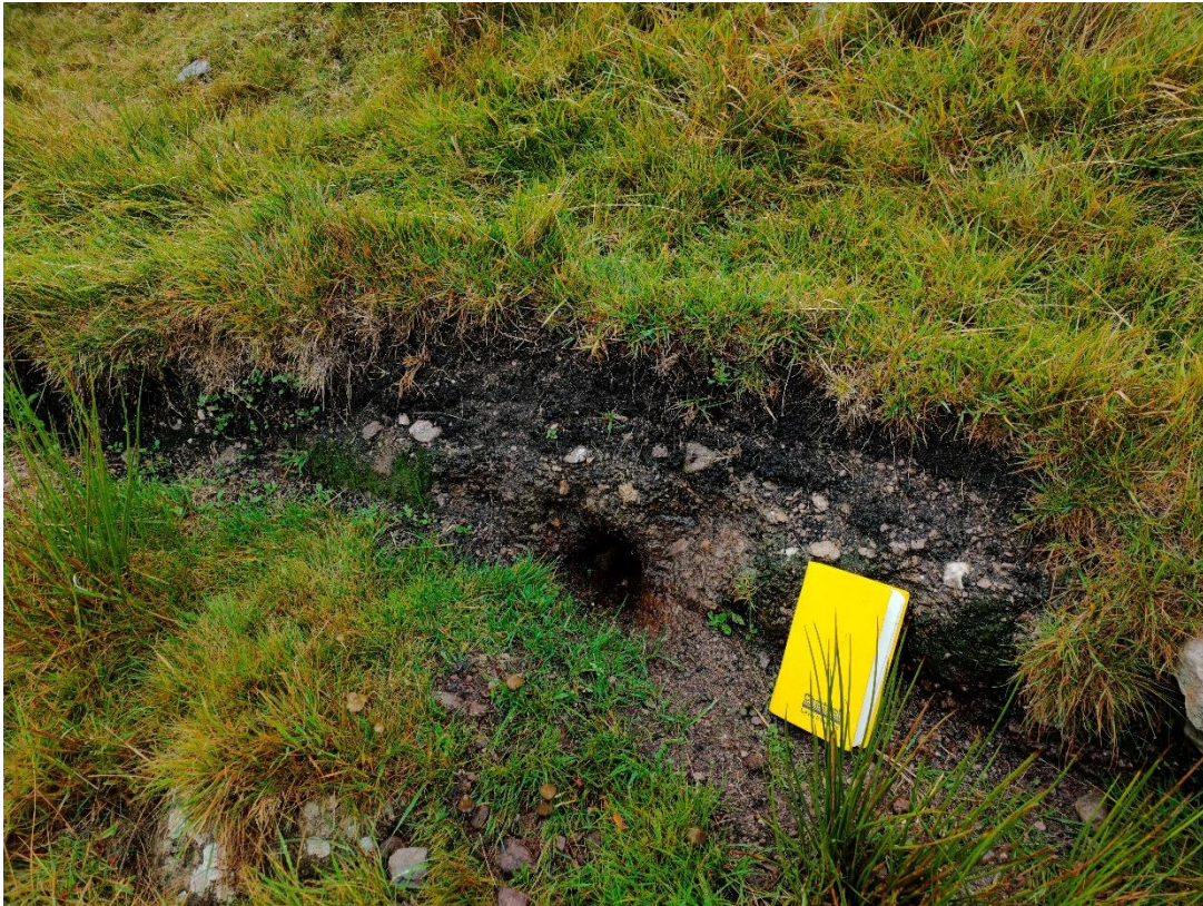
Point of interest location Ph003 (view west) – cut exposing 100mm blanket bog over till