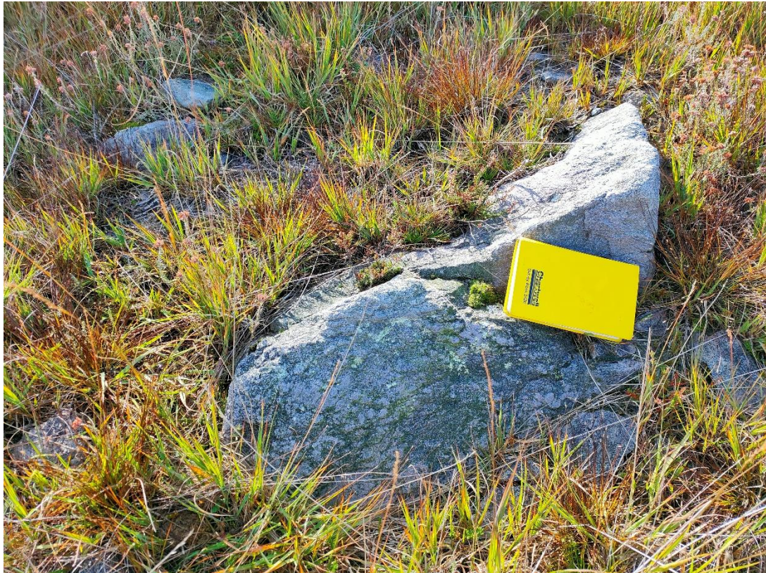
Probe location 012 (view north) – conglomerate outcrop/large boulder.