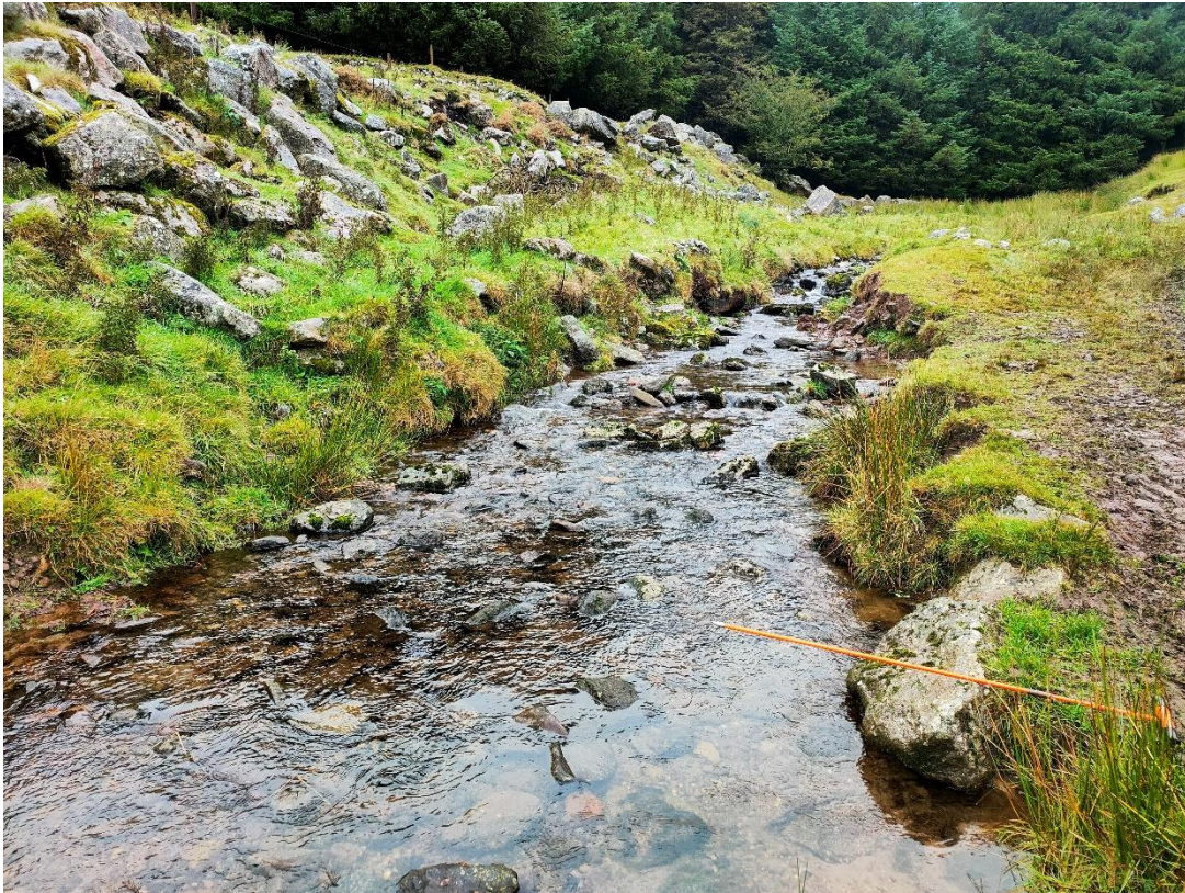
Point of interest location Ph011 (view north) – stream exposing Till with no indication of Alluvium