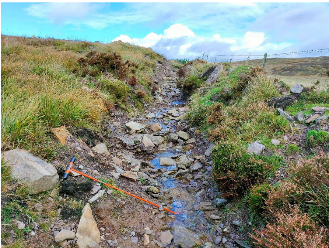
Point of interest location Ph004 (view north-northeast) – ditch exposing 100mm blanket bog over till