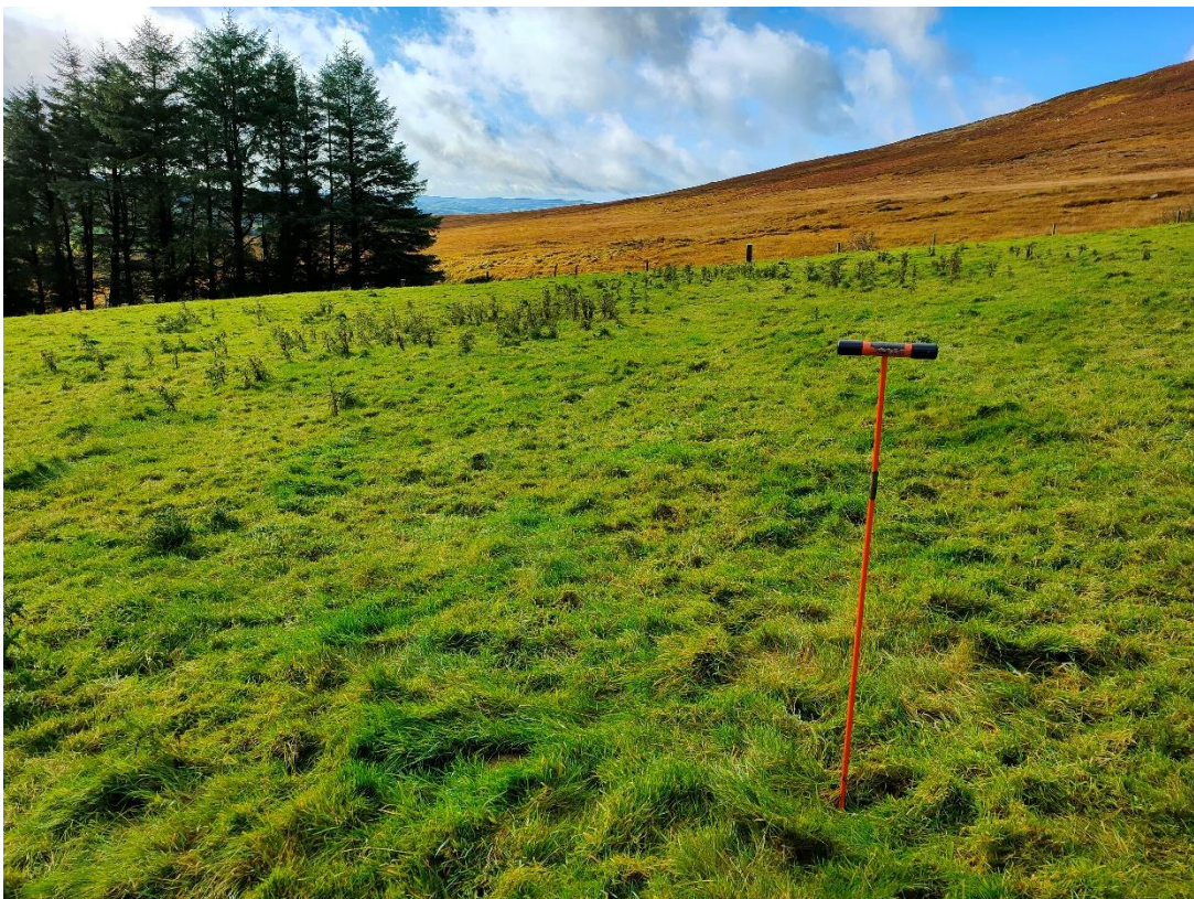
Probe location 057 (view south) – at substation