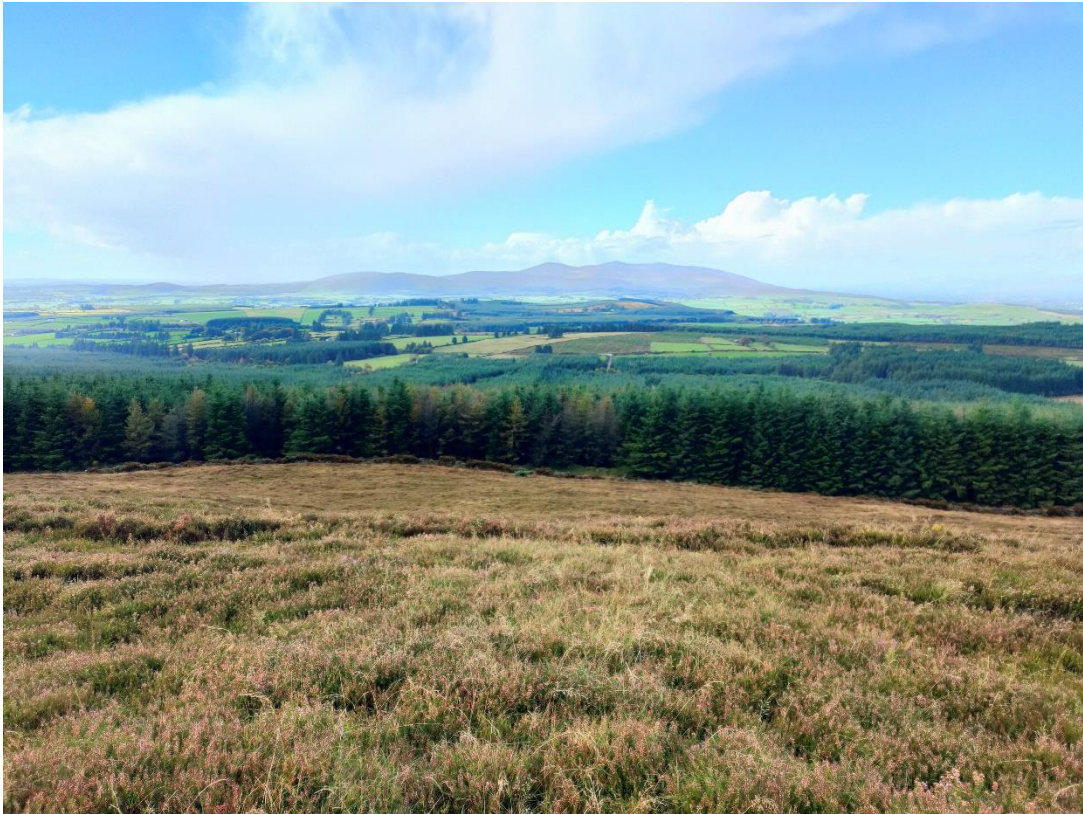
Probe location 039 (view west) – Till exposed at ground level at this location