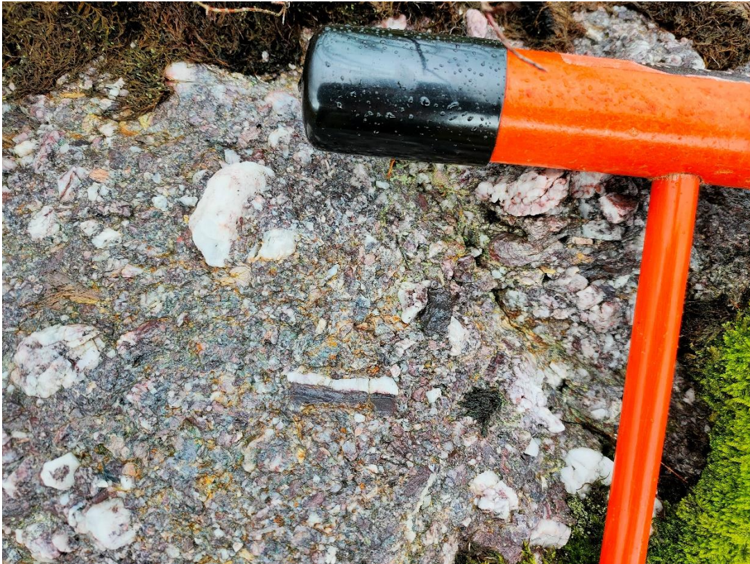
Point of interest location Ph017 (view east) - Possible outcrop or large boulder of conglomerate