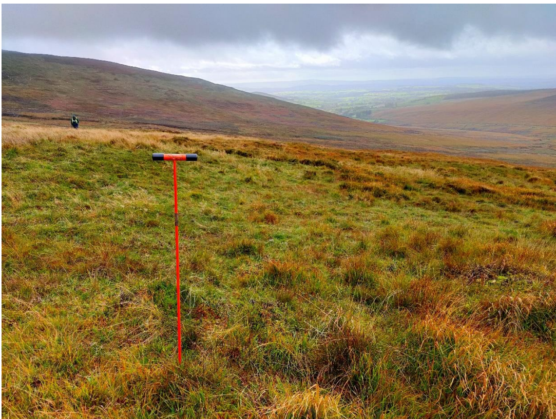
Probe location 023 (view south) – at Turbine T06