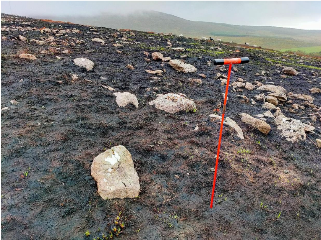
Probe location 006 (view south) – recently burnt vegetation exposing conglomerate boulders