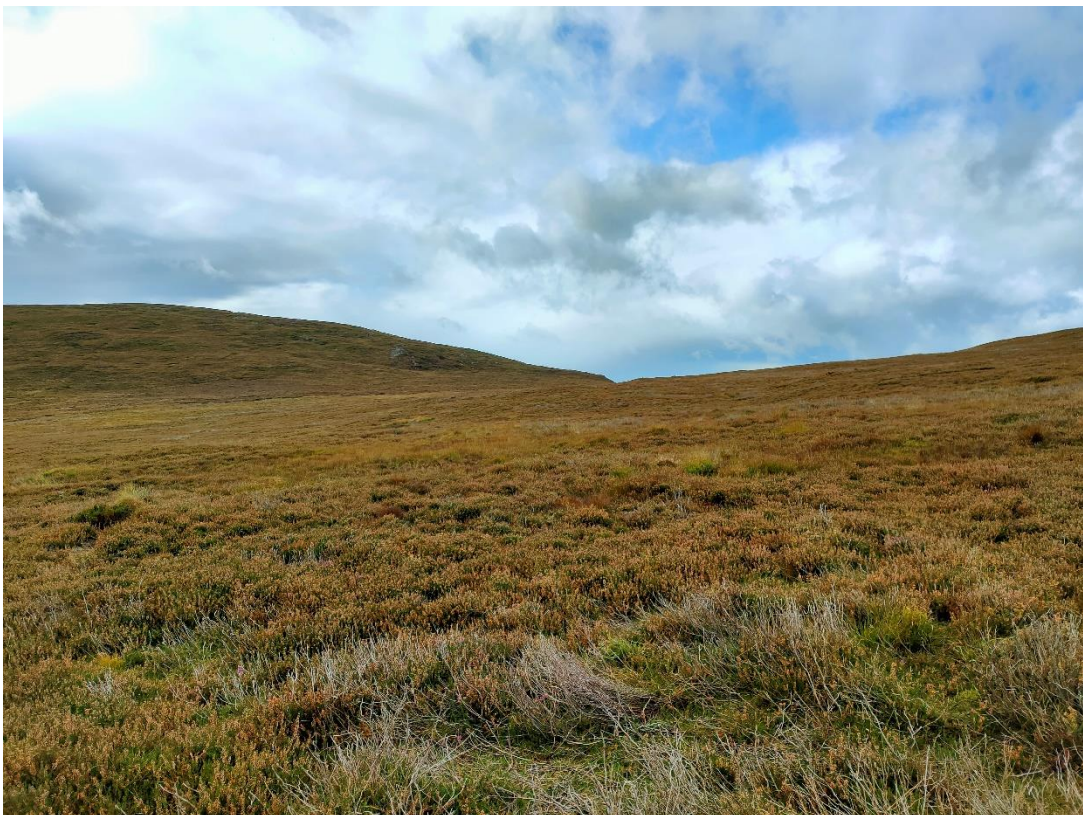
Probe location 052 (view west-southwest)